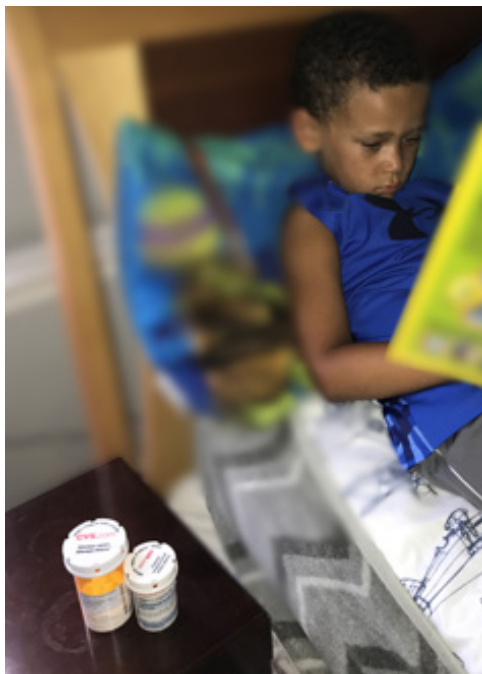
Engage Image #1