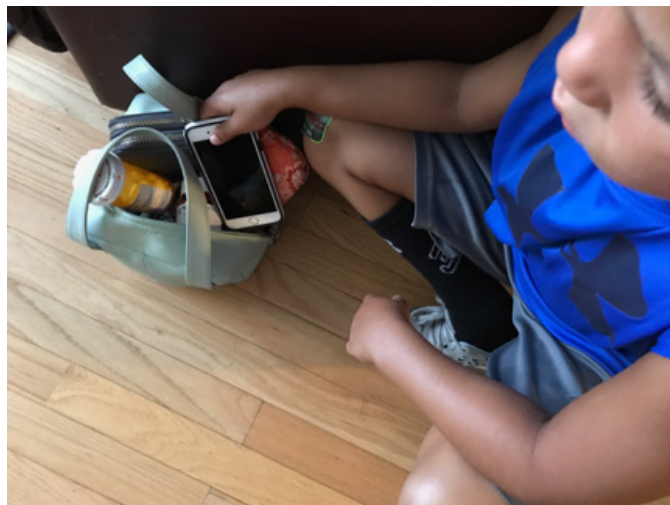
Engage Image #2