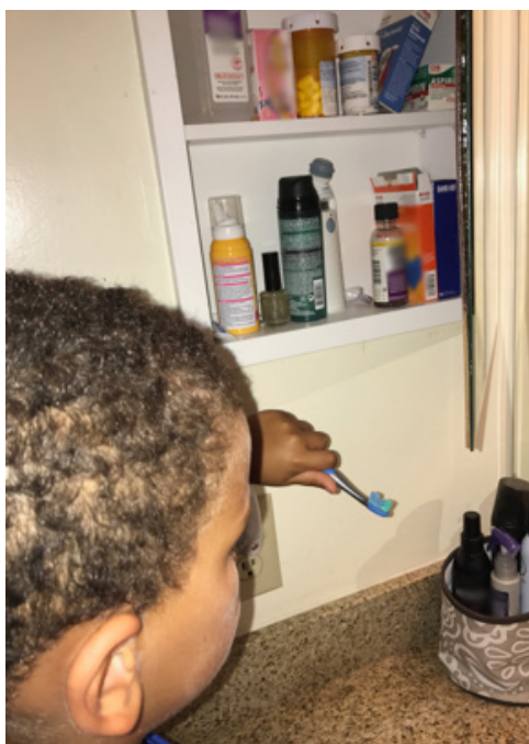
Engage Image #3