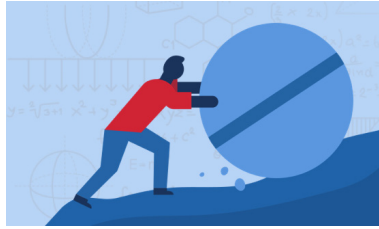
BRAIN AND BODY

Learn the basics of what opioids are, while discovering the origins of the epidemic and how it has evolved. Employees will gain perspective into how the opioid epidemic affects people on a personal level.