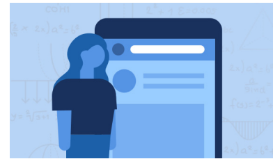
PREVENTION FOR INDIVIDUALS AND COMMUNITIES

Discover the affects opioids have on communities, and learn methods for supporting those who have been directly impacted. Employees will find out how crucial support and treatment can be located in one's community.